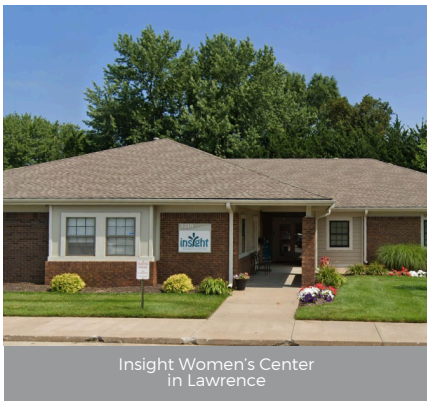
Insight Women's Center in Lawrence